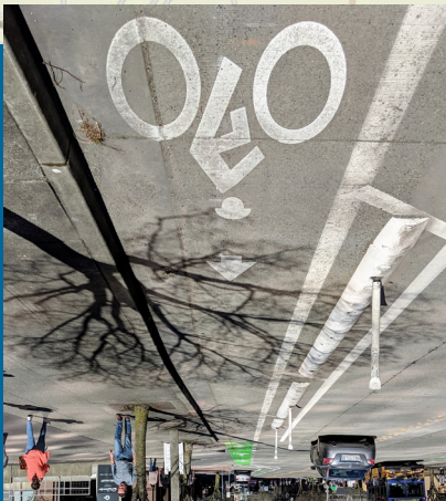
Example of the type of bike lane coming to Eastgate Way.